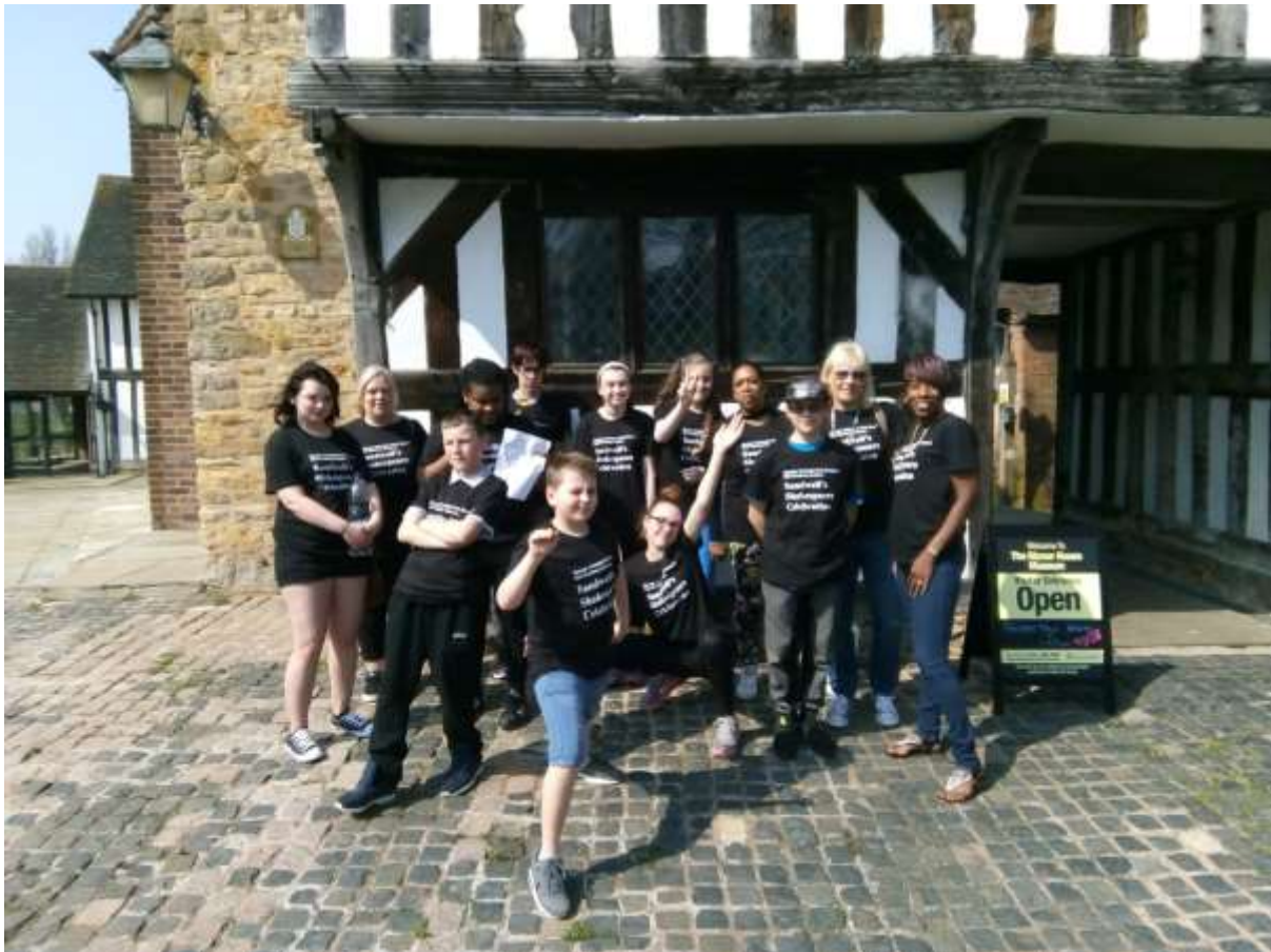
Meadows Youth Club taking part in the Emerge Festival 2018 at The Manor House, West Bromwich

Comment from a visitor to the Emerge Festival 2018.