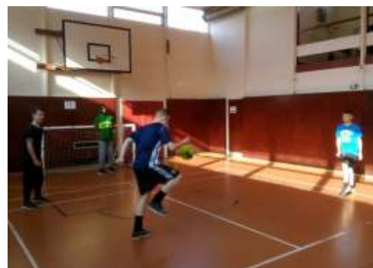
Lodge Road Youth Club, West Bromwich

Youth Club Provision – There are 8 youth clubs altogether with at least 1 per town in Sandwell offering personal and professional development workshops for accreditation opportunities around First Aid, ASDAN, Food Hygiene and Duke of Edinburgh. Workshops are also offered on drugs & alcohol, sexual health, smoking awareness, teenage pregnancy, sexual exploitation, bullying, self-image, confidence and more. Clubs provide social and recreational activities too. Youth clubs develop an action plan with young people that drive activities based on young people's needs.