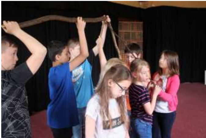
Army Covenant Residential

Everyone on the estate knows or asks about