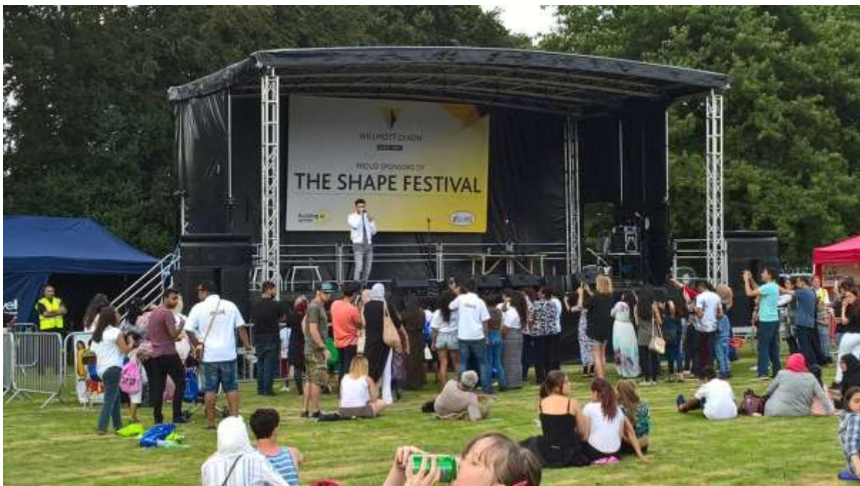
SHAPE Youth Festival weekend at Sandwell Valley