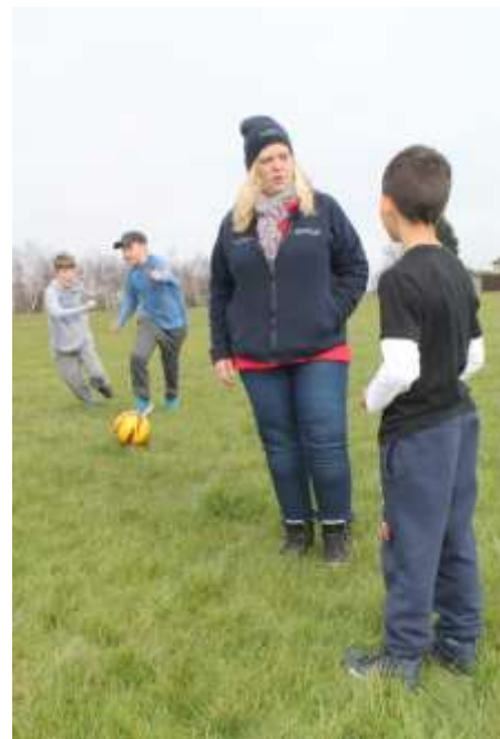
Detached session on Bilston Rd., Wednesbury

Detached Teams – Provision of two detached teams in each of the six towns that operate two sessions per week. Targeted at vulnerable and excluded young people that may not be reached or choose to engage with mainstream youth work. It takes place on young people’s own territory such as streets, café’s, parks etc and at times appropriate to them. Each team is designated a neighbourhood to work on which are identified according to the needs of young people and following