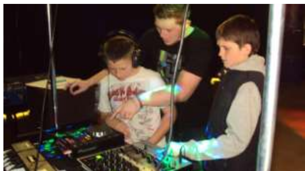
EYS one-to-one referrals

Meadows Youth Club – Meadows runs from the Meadows School and is a boroughwide provision for young people aged 11-25 with learning difficulties and disabilities. The club runs a variety of activities planned with young people to develop life skills and independent living skills. Sessions include cooking, health and wellbeing, sport and fitness, amongst others. This is a very welcoming club with a very skilled and experienced staff team and due to the nature of this club an assessment is required to ensure we are fully able to meet the needs of the young person.