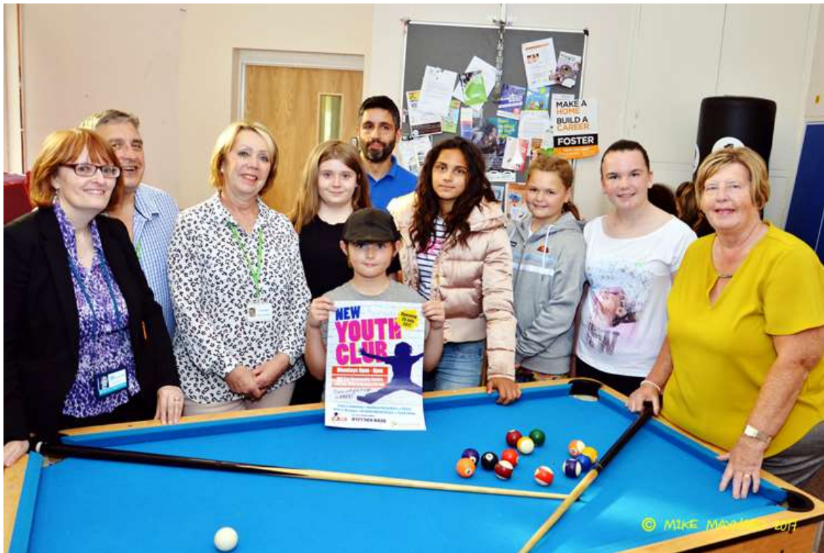
Launch of Hill Top Youth Club in July 2017

“I’d be bored and get into trouble if it wasn’t for the youth club”