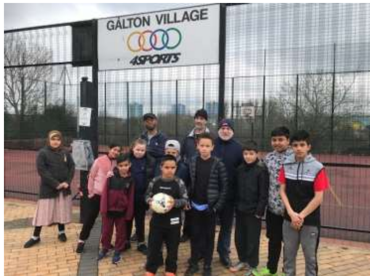
Galton Village Detached Team

The Youth Service is structured on a town based approach with some borough wide services. For each of the six towns, there is one open access youth club, two in West Bromwich and two detached youth work teams per town. This structure allows for an area based approach to targeted work with young people and their families as part of the Early Help work in the borough.