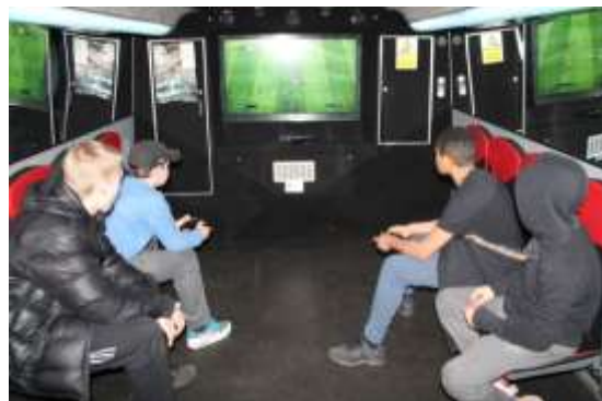
Young people playing Xbox inside the Youth Bus