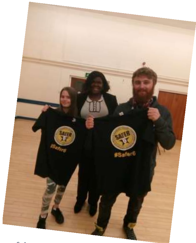
Safer 6 launch at the Tanhouse Youth Club, Great Barr