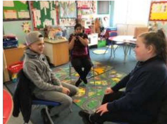
Children in Galton Village taking part in 'Galton's Got Talent' project

Enhanced Youth Support (EYS) – works with young people from across the borough, using a targeted youth work approach that supports them to deal with their individual issues through both one to one and group interventions. Staff use the Signs of Safety approach and measure young people’s journey’s through Outcome Star.