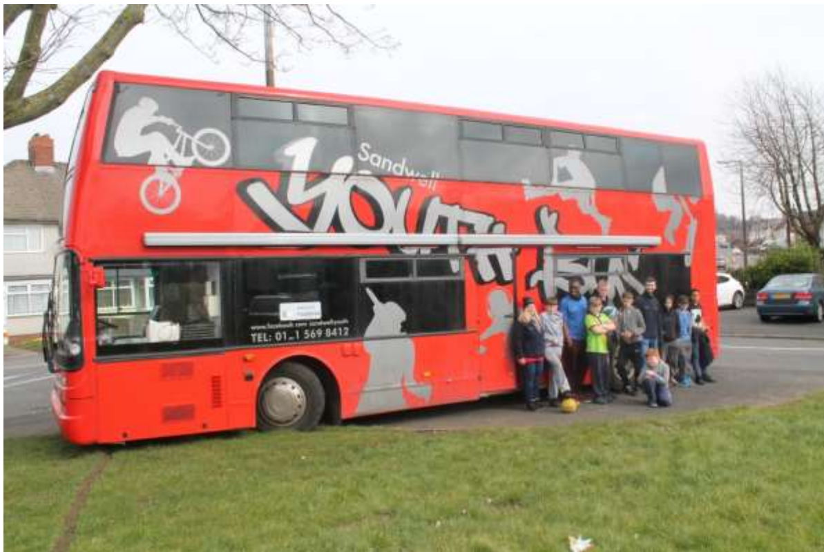
Youth Bus just arriving at a detached session