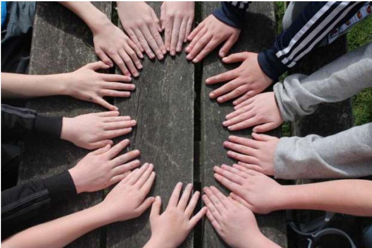
Children from military families and Sandwell youth provisions join hands as a show of friendship and integration

The project has demonstrated that residential creative arts or outdoor adventure programmes are a powerful way of bringing together individuals and groups from different backgrounds, breaking down barriers and increasing understanding, and encouraging friendship, simply by the intensive shared nature of the experience. The process was not forced; it happened naturally with gentle support and encouragement from professional staff for the children and young people to engage with and enjoy the activities and environment together.