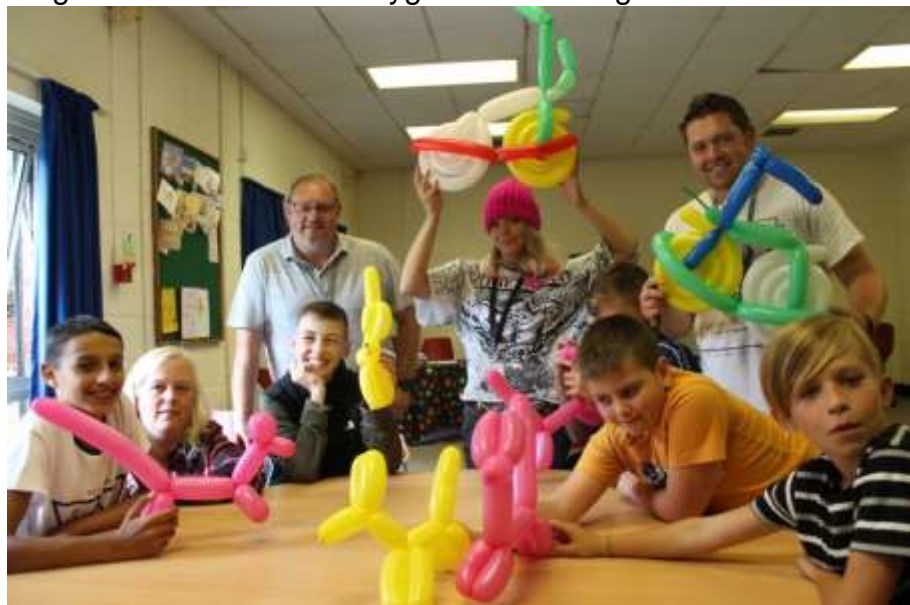
Magic & circus skills session at Coneygre Centre

Coneygre Arts Centre – The Centre provides a variety of opportunities for young people to engage in the arts with regular open access sessions around live music, recording studio sessions, open mike nights, drama / theatre workshops, event / festival planning and magic & circus skills. Coneygre is also a registered centre for the Arts Award and young people can achieve a nationally recognised qualification from their participation in the arts.