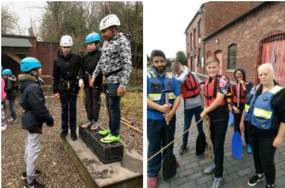
Teamworx outdoor sessions

Teamworx – A targeted early intervention programme led by the Youth Service in partnership with the Police and Fire Service with support from schools and Community Operating Groups (COGs). The programme has been nationally recognised by being shortlisted for a Children & Young People Now Award in 2018. The programme addresses issues of a lack of role models, self-discipline and confidence. Programme delivered over 6 weeks period, at least 3 times a year focusing on years 5 & 6 in Primary Schools. Currently delivering in 5 towns. Young people are selected by schools for a range of Adverse Childhood Experiences (ACE's).