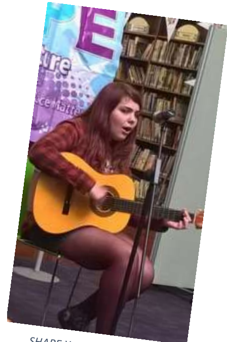
SHAPE Your Talent contestant

“Youth Services have enhanced the SHAPE Programme and been the core delivery mechanism of the Programme developing excellent partnership working not just with SHAPE but through the voluntary sector as well ensuring the programme utilises all the services offered to children and young people appropriately and builds on existing relationships. The team of staff are a pleasure to work with and are always there to support when required. I look forward to continuing to build this relationship and strengthen the partnership working we already have in place.”