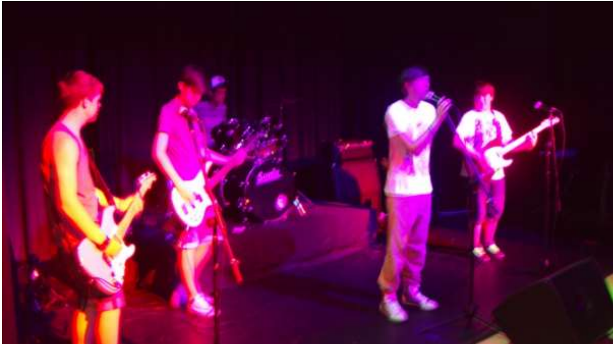
One of the regular open access live music sessions at Coneygre

of a photography project with Multi-Story, animation tasters with Creative academies, A Positive Life Dance Workshops and performance and support to Youth Offending Team and Sandwell Community School to provide one to one sessions of alternative education through arts programmes.