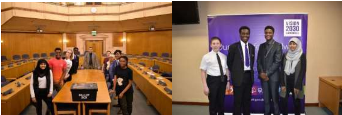
UK Youth Parliament Election Candidates and winners

The Youth Service has been an integral strategic and delivery partner of the SHAPE Programme. We have supported the development and delivery of activities and events including organising and managing stage and acts for SHAPE Your Talent and SHAPE Youth Festival and helping to develop and support the SHAPE Youth Forum, including elections for the UK Youth Parliament. Other support has included conducting surveys, delivering the Clickwise online Safety Programme and Anti Bullying Roadshow. The support from the Service to the Programme has been recognised as being key to its development and success. The programme has received regional recognition with 4 Youth Voice Awards from the British Youth Council and both the Shape Programme Manager and Youth Service